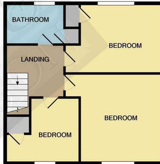
1ST FLOOR APPROX. FLOOR AREA 451 SQ.FT. (41.9 SQ.M.)

TOTAL APPROX. FLOOR AREA 1325 SQ.FT. (123.1 SQ.M.)